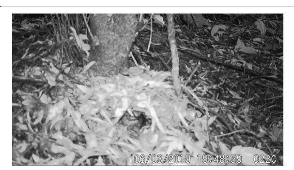
Fig. 1 The video screenshot showing that a hen Sichuan Partridge and its brood were roosting in their nest at night (data from Nest 201909)

The nests were located through systematic searches during the breeding season. We monitored breeding behavior of the partridge using Tinytag Plus 2 temperature data loggers (TDL) (TGP-4520, Gemini Data Loggers, UK) and infrared cameras (IC) (Ltl 6210, Acorn, CN). The data logger had two external probes, which allowed us to record both internal nest and corresponding ambient temperatures (Fu et al. 2012). The temperature difference was taken as an indicator of adult presence and absence from the nest (Manlove and Hepp 2000; Greeney 2009). The infrared cameras placed at or around the nests were used to monitor activities of